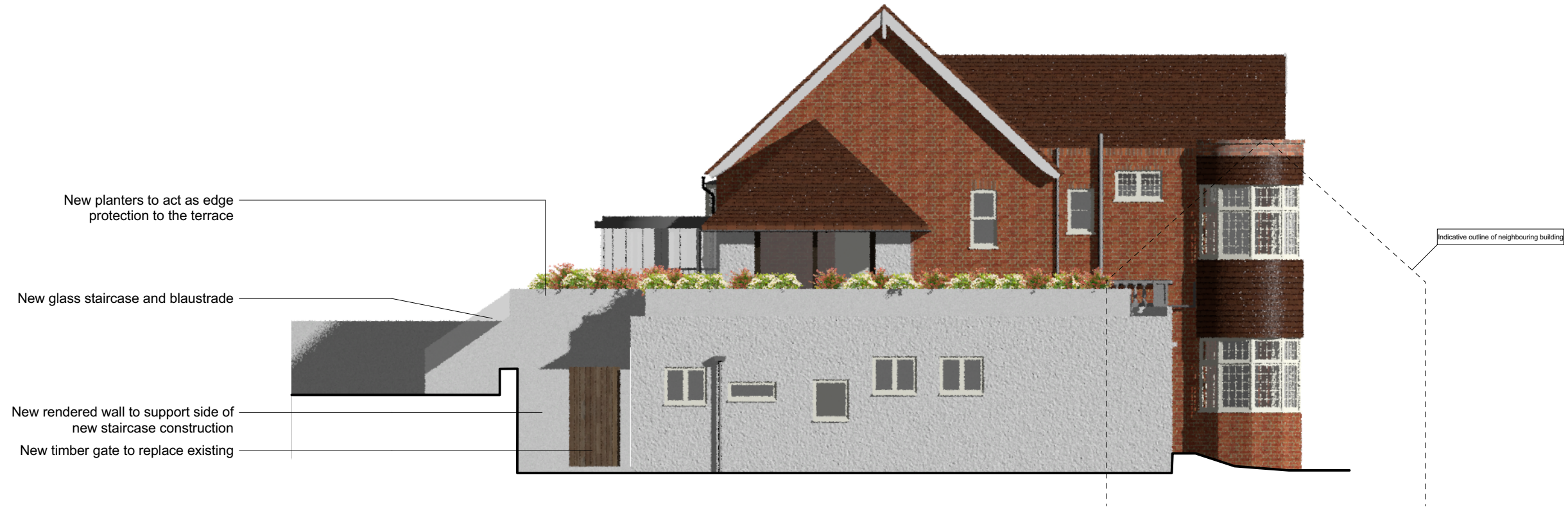
PROP. NORTH WEST ELEVATION 1:100